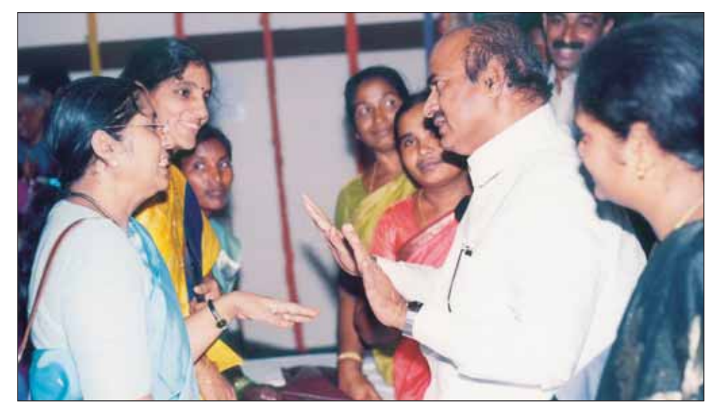
EWRs with the AP State Panchayat Raj Minister JC Diwakar Reddy

OLLOWING the passage of the 73rd and 74th amendments to our Constitution in 1993, one-third among elected representatives at all levels in our local governments are women. The past decade-and-a-half had witnessed the election of enthusiastic and competent women to village, mandal, district and municipal level offices in Andhra Pradesh. However, these elected women representatives (EWRs) have been consistently rating their own performances as sub par. There are two key reasons: